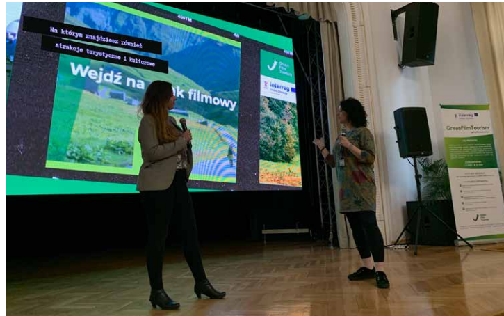
Opening of the Subcarpathian Film Route in the Bieszczady Mountains, (Poland) 24-28.07.2022.