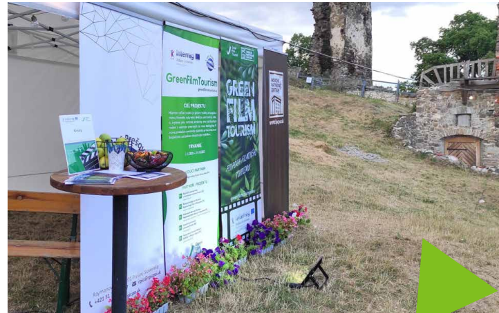
5th BNP PARIBAS Green Film Festival, Krakow (Poland), 14 - 21.08.2022.