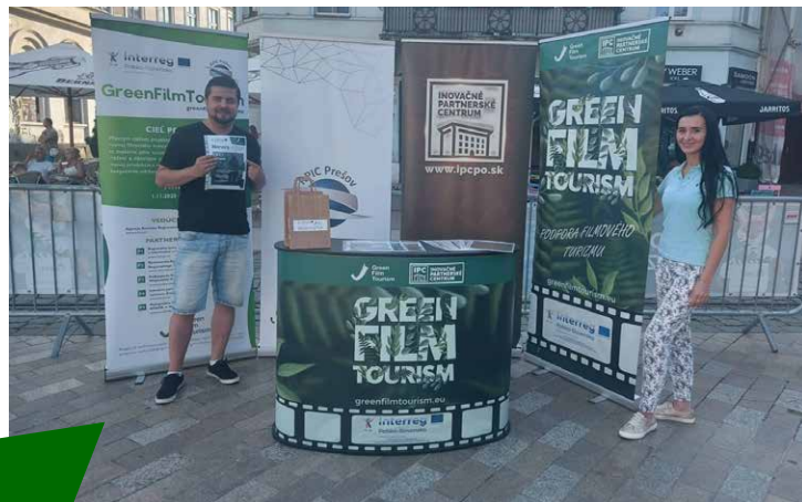
Film Night at Šariš Castle 2022, Kosice (Slovakia) 16.07.2022.