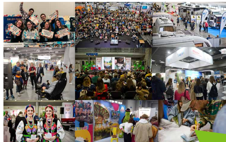
Industry meeting of representatives of the Slovak and Polish film industry, Jaślicka (Poland) 23.09.2022.